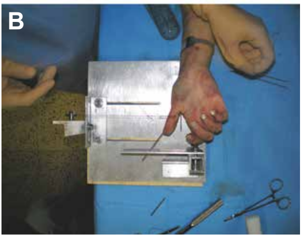
Figure 2. Custom-built jig used for the study (A). The first metacarpal was secured onto the jig to allow for constant bending moments (B).