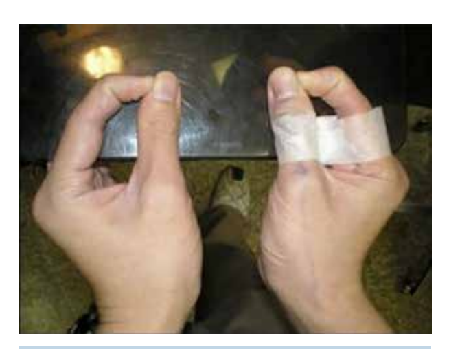
Figure 1. The application of buddy taping the thumb to the index as a functional brace for UCL injuries.

Although thumb spica splints are commonly used for treatment of UCL injuries of the thumb, good results after functional bracing of ligamentous injuries of the MCP joint of the thumb have been reported (2,3). Functional bracing is particularly useful as definitive treatment for incomplete ruptures or interim treatment while awaiting surgery. However, functional bracing is limited by the lack of widespread availability. The purpose of the study was to assess the effectiveness of buddy taping as a functional brace for treatment of UCL injuries of the thumb by using a cadaveric model (Figure 1).