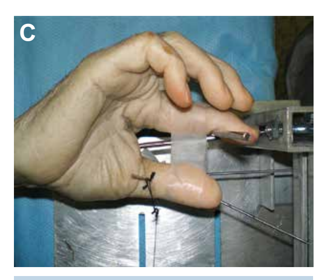
Figure 3. Valgus stress at 30° thumb flexion applied with proper and accessory UCL incised ( A ), buddy taping of thumb to index ( B ), a with the index immobilized ( C ).

MVLE and MVLF were 33.3^{\circ}\pm19.0 and 39.8^{\circ}\pm18.8 (PC); 46.7^{\circ}\pm4.2 and 44.7^{\circ}\pm6.4 (AC); and 50.3^{\circ}\pm8.7 and 48.3^{\circ}\pm3.5 (VP) (Tables 1-3). In all three groups (PC/AC/VP), BT with the index immobilized produced a significant decrease in MVLE to 6.5^{\circ}\pm4.9 (p=0.02), 8.5^{\circ}\pm7.8 (p=0.03), and 3.0^{\circ}\pm4.2 (p<0.01), and MVLF to 4.7^{\circ}\pm4.5 (p<0.01), 9.5^{\circ}\pm9.2 (p=0.04), 0^{\circ} (p<0.01), respectively. With the index free, BT did not significantly reduce MVLE: 28.5^{\circ}\pm5.0 (p=0.06)(AC), 37.5^{\circ}\pm17.7 (p=0.49)(VP) or MVLF: 26.0^{\circ}\pm5.7 (p=0.18) (PC), 34.5^{\circ}\pm14.9 (p=0.549)(AC), 40.7^{\circ}\pm11.01 (p=0.313) (VP).